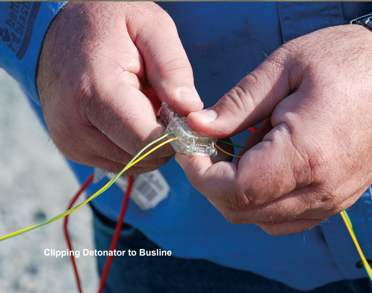
Clipping Detonator to Busline